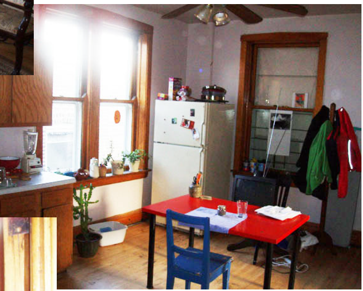
Privately owned by neighborhood resident-- no management companies.

$750/mo, one month S.D., lease terms flexible.